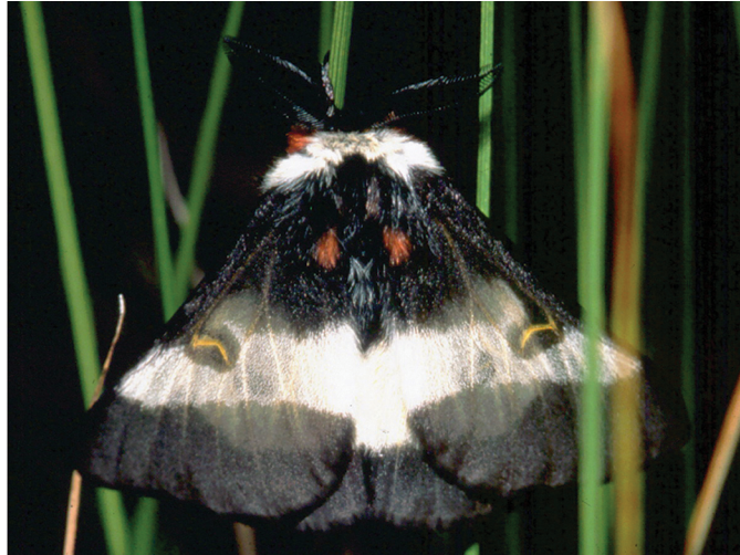
Adult Bog Buckmoth