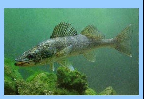
A walleye in its natural environment