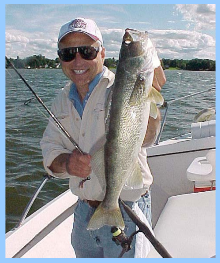
Walleye angling is popular on Oneida Lake