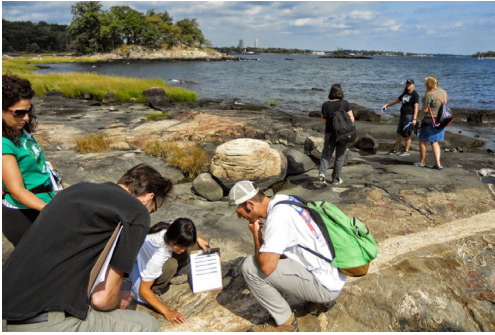
Teachers learn how to do a marine debris shoreline survey.

“I learned where the rocks on the beach came from and another way to classify them. Since I am not Environmental Science certified, this really helped me.”