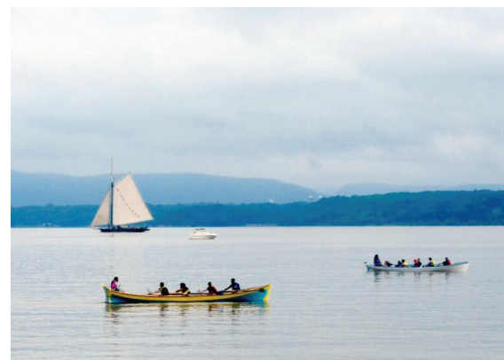
Boaters enjoying the Hudson near Croton Point.

Explore: The Hudson is surrounded by urban and rural landscapes.