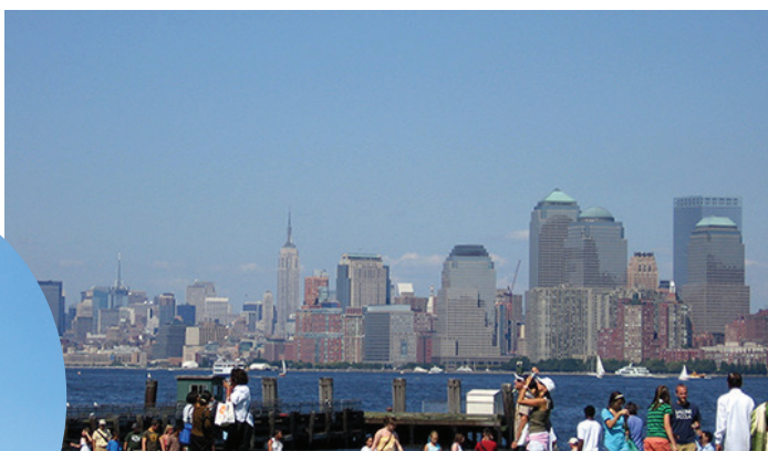
Visitors enjoy the NYS Skyline from Liberty Island.