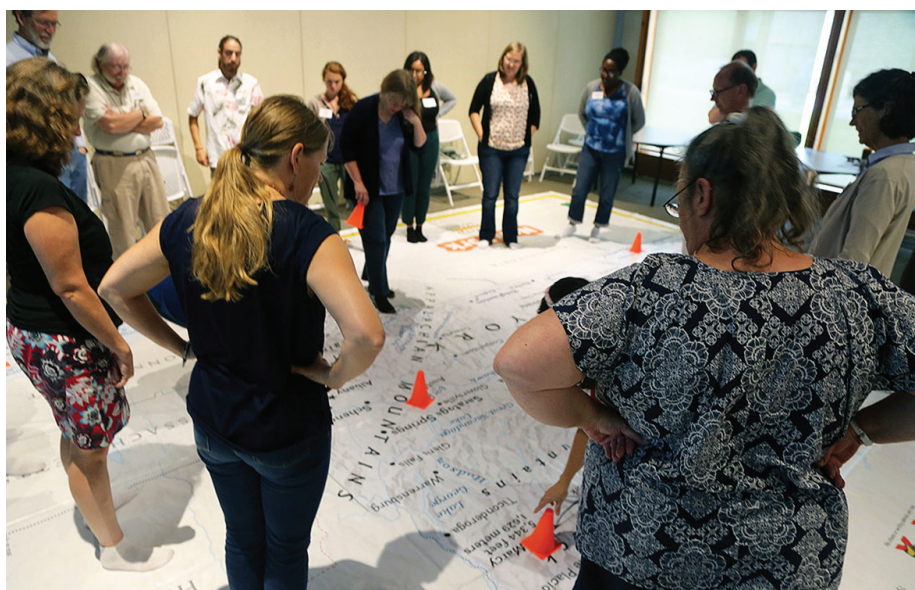
Educators explore the New York State Map at a workshop in Hyde Park, NY.

The National Geographic -produced New York Giant Traveling Map is a great opportunity to raise student's awareness of our important coastlines.