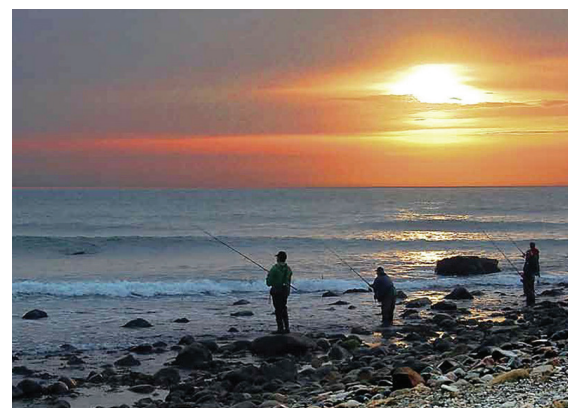
Sunset at Montauk Point.