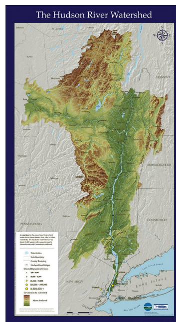
Satellite image of Hudson River watershed.