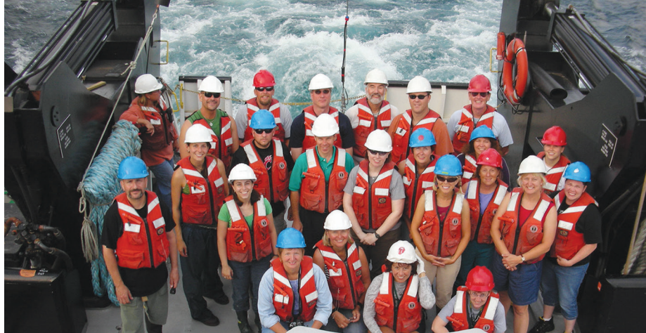
Teachers participate in a NY Sea Grant Great Lakes Workshop.