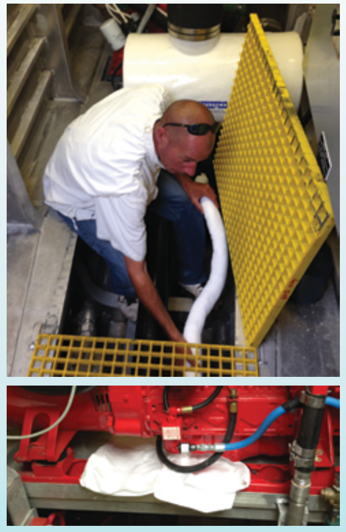
Oil absorbent booms, sheets (bottom), and pads can be kept on your boat to catch leaks under the engine or to contain and remove oil at the surface of the water (back). Bilge socks (top) trap any oily overflow on board, making safe disposal easy.

PURCHASE oil absorbent cleanup materials at boating stores and keep on board to prevent and contain spills.