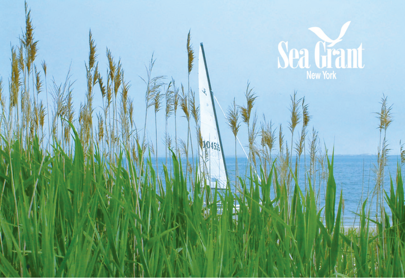
The common reed, Phragmites australis , has invaded many wetlands throughout North America.