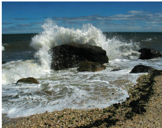
Long Island Sound, Southold, NY. The health of Long Island's estuarine resources is vital to New York's economy.

Following NYSG NEMO outreach, communities have improved construction and post-construction requirements, and procedures for site plan review and inspections. Changes include an ordinance for retention of rainwater from new driveways, and erosion and sediment controls for projects smaller than an acre. Nassau County strengthened its drainage requirements by limiting the volume of runoff allowed to be discharged into its stormsewer system and by further encouraging development practices that reduce impacts. Nassau and Suffolk counties, as well as several towns and villages, have initiated storm drain retrofit projects.