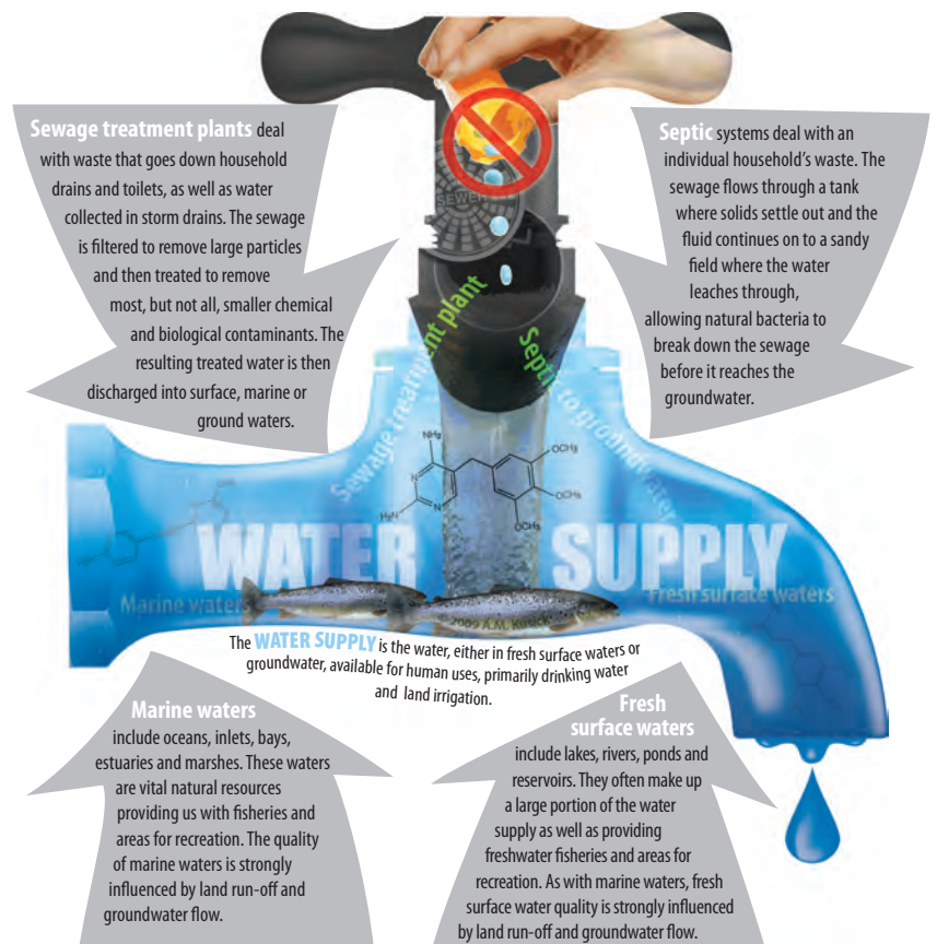
Illustration by Anita Kusick

Groundwater is water that is stored in the pore spaces of the ground and is replenished by water percolating through the unsaturated soil above. This includes rainwater and other sources. Half of the United States get drinking water from groundwater.