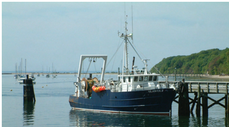
Several newly-funded projects will conduct experiments from the research vessel RV Seawolf , seen here docked in Port Jefferson Harbor on Long Island Sound.