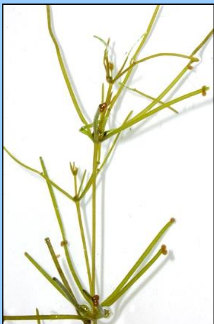
Close up of starry stonewort Jeroen Huls