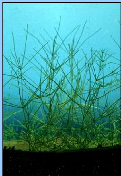
Starry stonewort