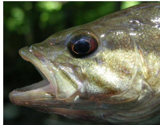
In smallmouth bass, the rear edge of the mouth does not extend past the back of the eye

Smallmouth bass prefer clear, cool water in habitats with rock or gravel bottoms. In Oneida Lake they eat yellow perch, gizzard shad, crayfish, insects, zebra mussels, and will occasionally eat frogs and tadpoles. Over the past 20 years, increased water clarity from zebra mussel introductions and increased food availability has led to record smallmouth bass populations in Oneida Lake.