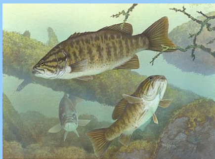
Drawing of smallmouth bass swimming in a natural habitat