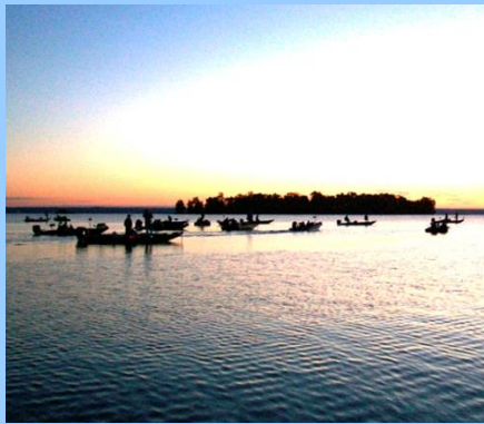
Bass boats during a recent fishing tournament on Oneida Lake