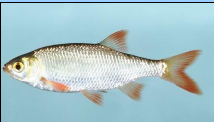
A silvery-colored rudd

Impacts that rudd may have on ecosystems are unknown. They are able to hybridize with the native golden shiner ( Notemigonus crysoleucas ), a popular bait fish in Oneida Lake. Rudd may also compete with native fish for invertebrate food sources. Because rudd are uncommon in Oneida Lake, their potential to negatively impact the ecosystem is low.