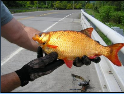
A brightly-colored rudd Sandra Rapp