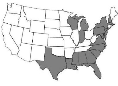
EEE has been identified in: MA, NH, NY, PA, DE, MD, VA, NC, SC, GA, FL, AL, MS, LA, TX, WI, MI, and IN