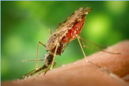
EEE is spread by mosquitoes