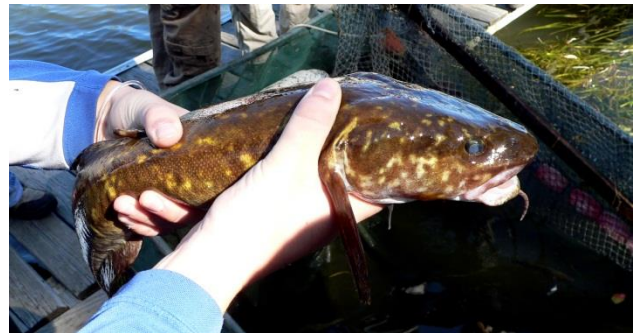
Oneida Lake burbot being measured by researchers