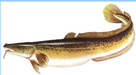
Detailed burbot drawing