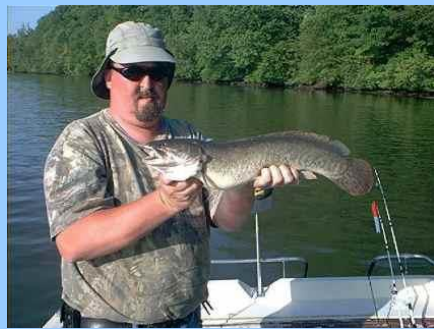
Oneida Lake bowfin angling is rare: http://www.thejump.net/id/bowfin.jpg