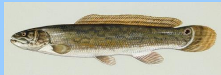
Bowfin line drawing