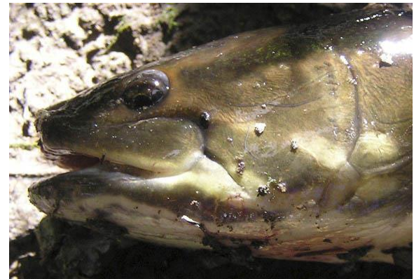
Close-up of a Bowfin's distinct head: www.glooskapandthefrog.org/bowfin%20eye.jpg