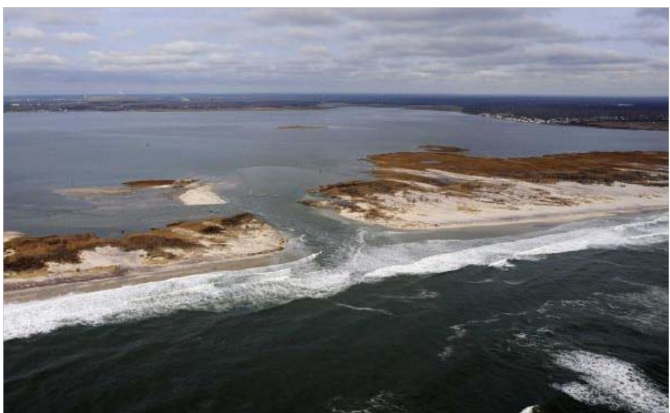
A breach in Fire Island is shown. (Dec. 20, 2012)

Originally published: February 1, 2013 8:37 PM Updated: February 3, 2013 9:51 PM