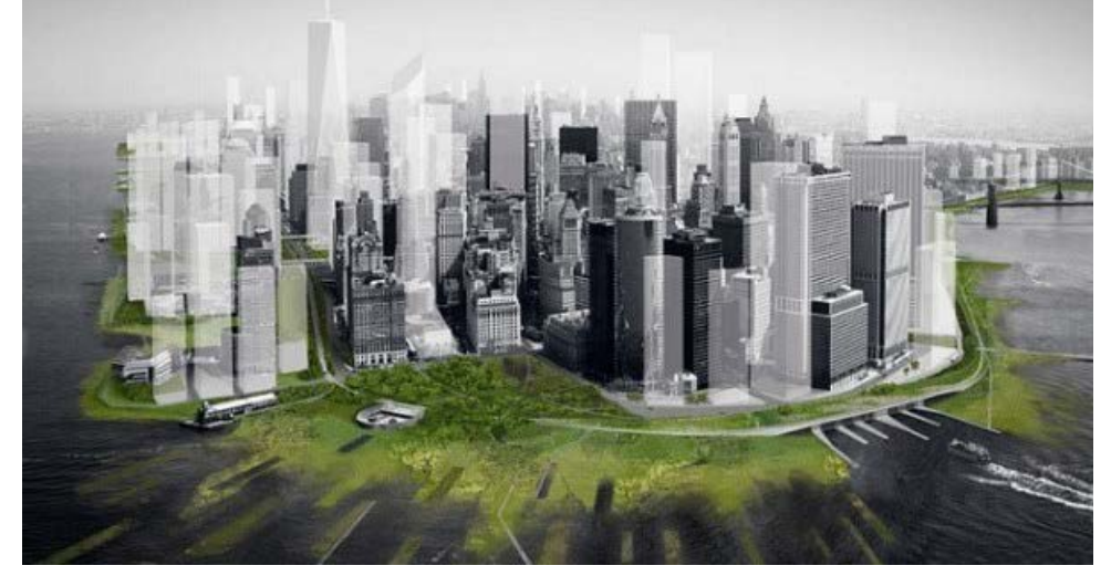
By 2080, New York City could be fortified with a belt of steel--or ringed with wetlands, as in this architect's vision

THE MOVEMENT POLITICS COLUMNISTS BLOGS DONATE