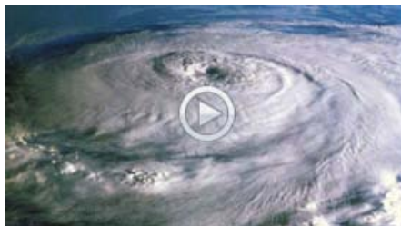
VIDEO: Hurricanes can do a LOT of damage - but can they do any good?