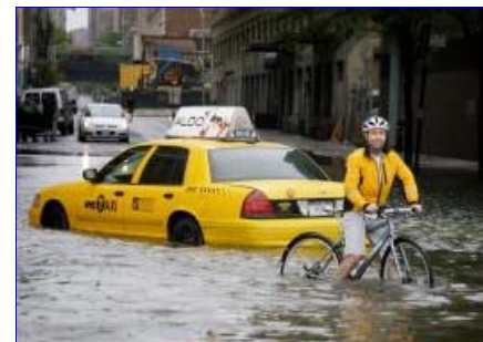
FILE - In this Aug. 28, 2011, file photo, a biker makes his way around a taxi stranded in floodwaters of Hurricane Irene, downgraded to a tropical storm, in New York. Two years before Irene created the prospect of a flooding nightmare in New York City, 100 scientists and engineers met to sketch out a bold defense: massive, moveable barriers to shield the city from a storm-stirred sea.