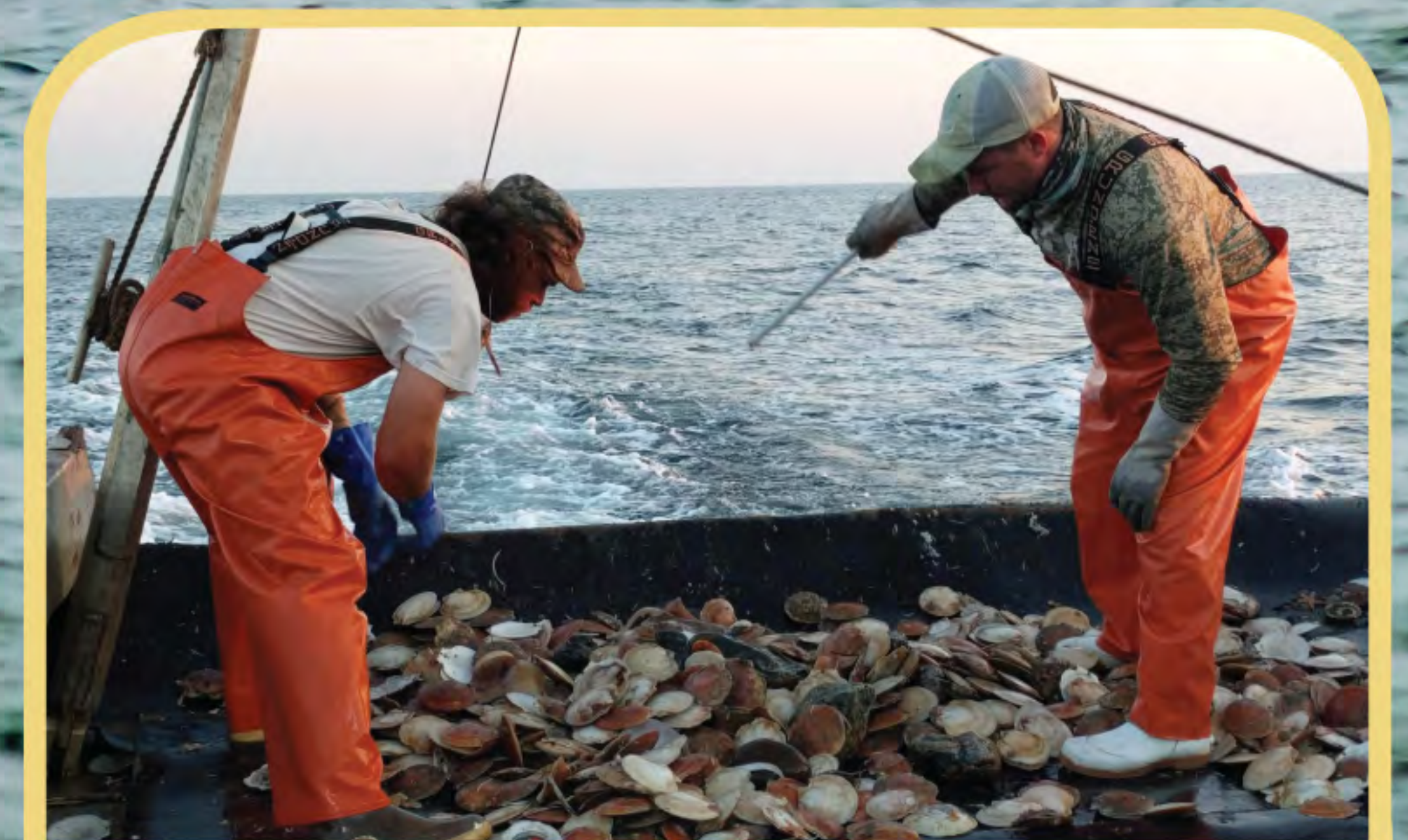
Scallops and bycatch are sorted on the deck. Bycatch is returned to the water.