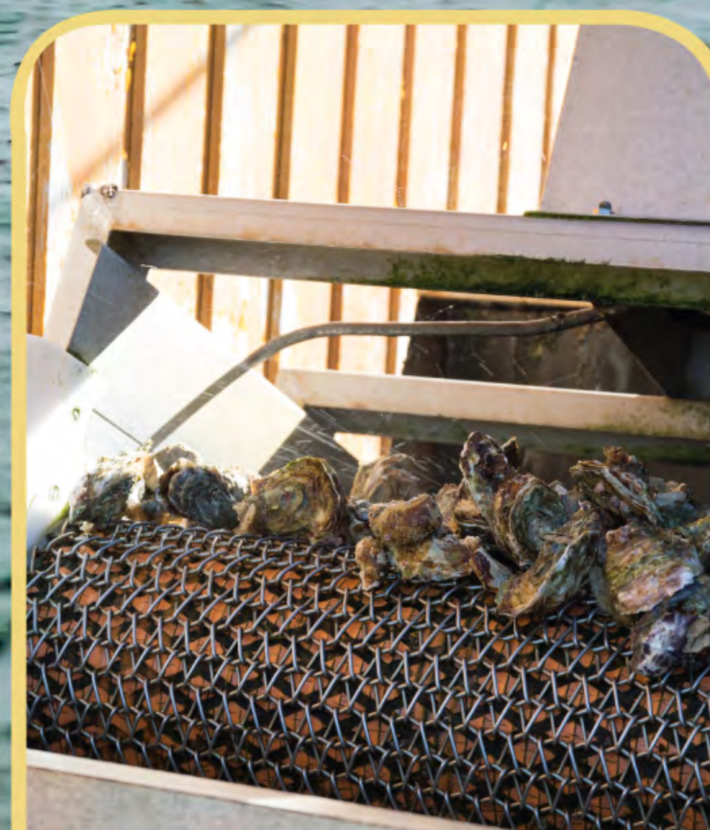
Oysters are sorted and cleaned.