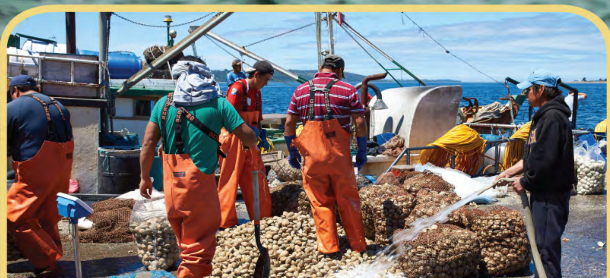
Clams are sorted and bagged for sale.