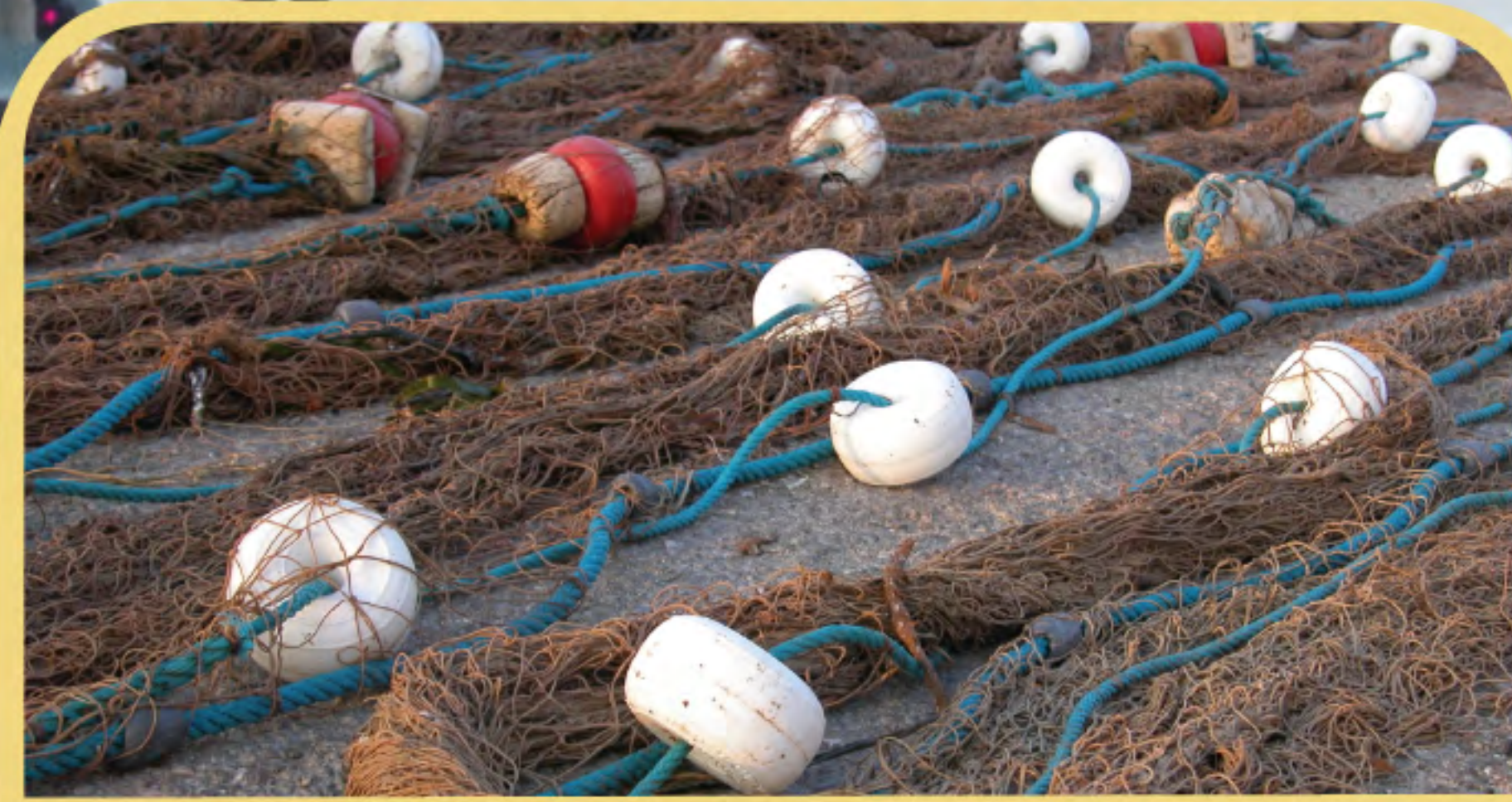
Gill net drying on the beach.

Trawls (dragners) are the most common gear being used in commercial fishing. Bottom trawls are funnel shaped nets attached to an otter board, and the gear is towed behind the vessel to capture fish. Other gears being used around Long Island include Long Lines, Gill Nets, Rod and Reel.