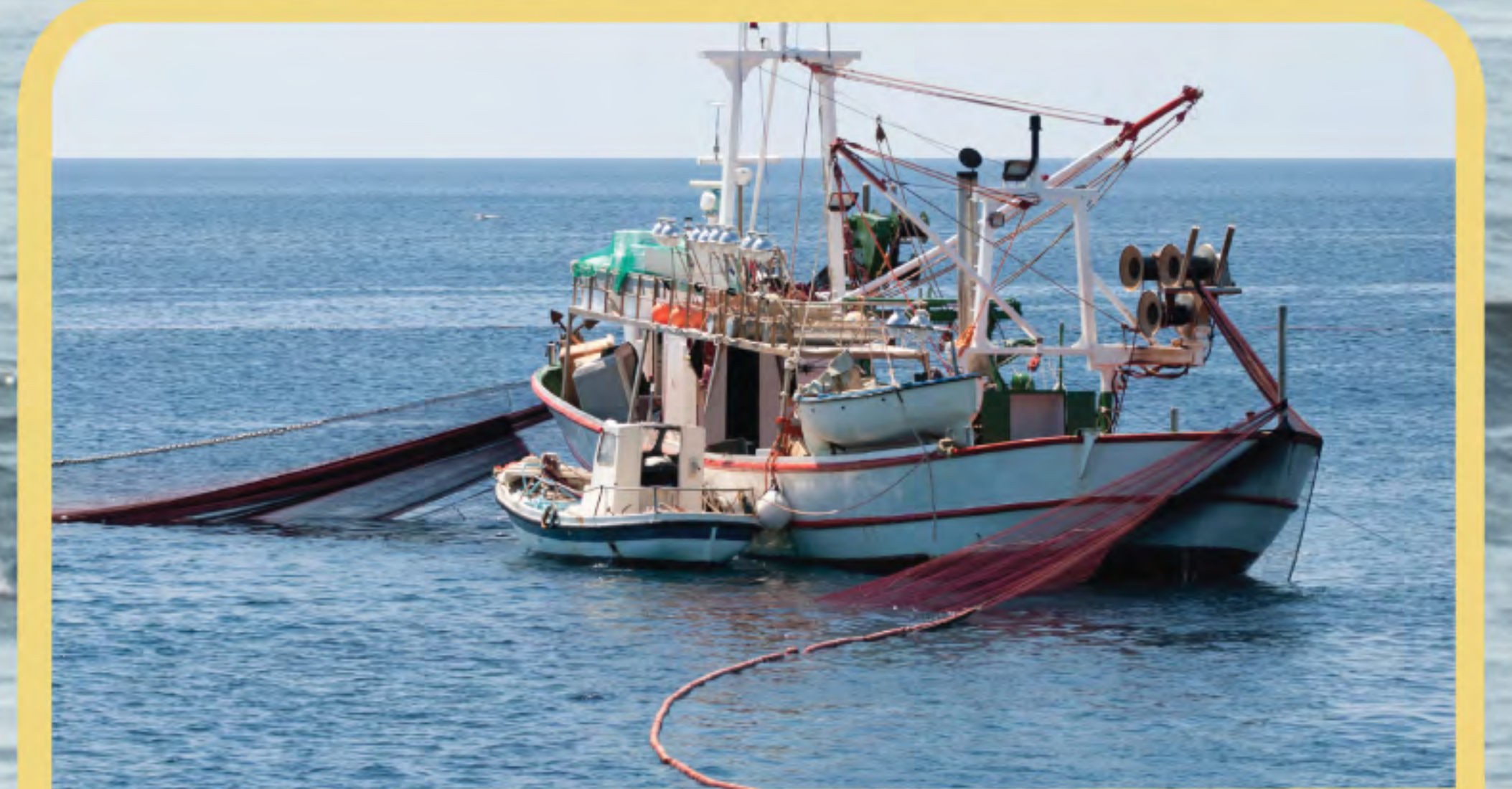
Trawler net fishing at sea.