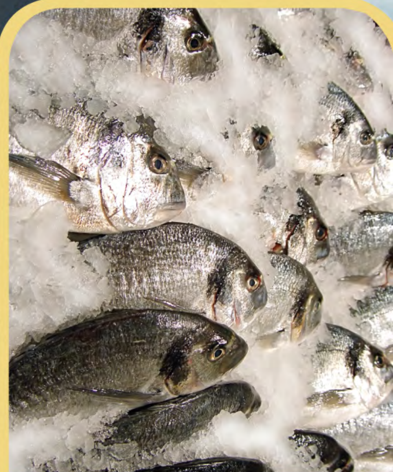
Fish packed in ice.