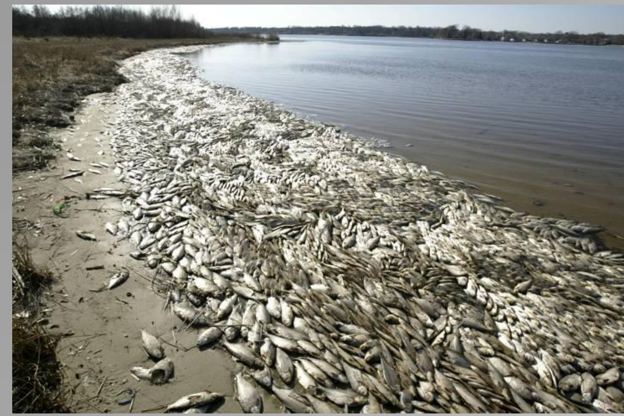
US Fish and Wildlife Service