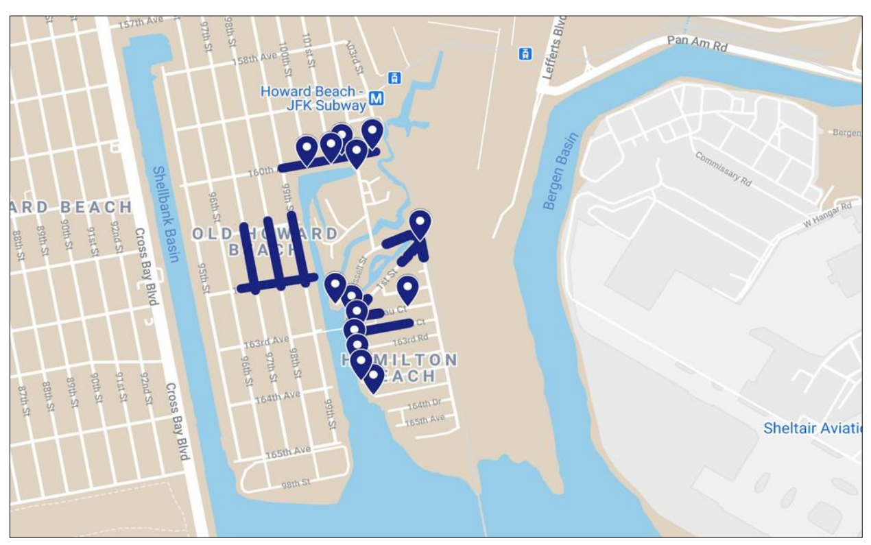
Map 2: Howard Beach/ Hamilton Beach Flooding Observations