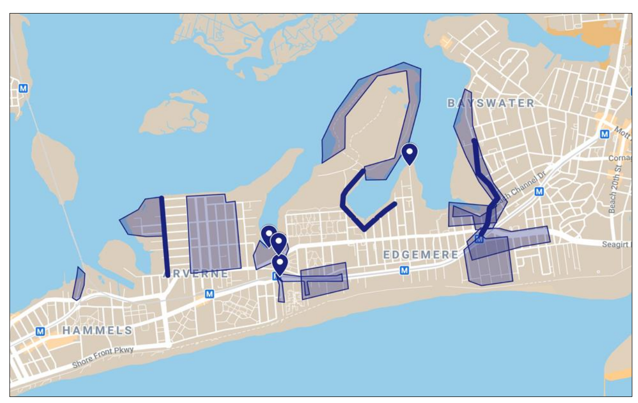
Map 3: Rockaway Flooding Observations