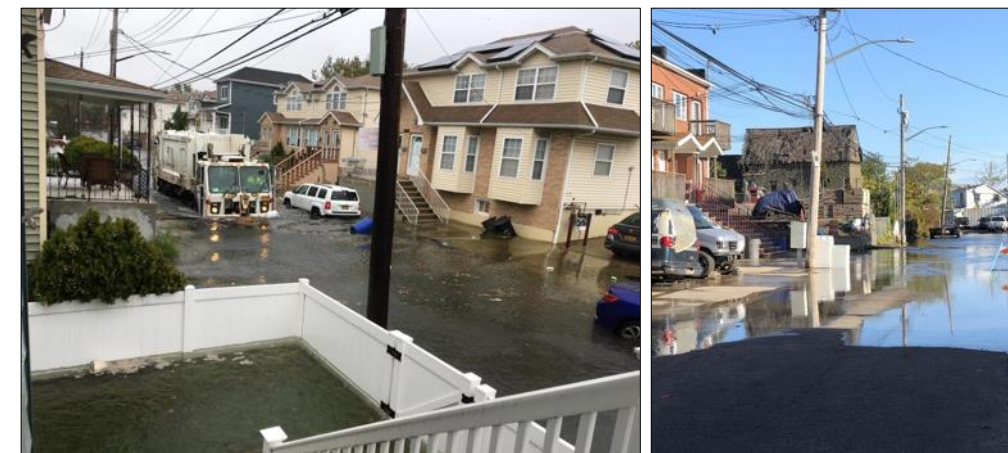
First Street in Hamilton Beach, Queens NY 11414