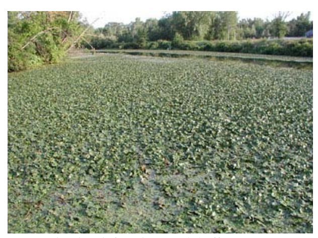
5. A major river infestation (Mehrhoff, IPANE)

lead to fish kills. Trapa's rapid and abundant growth can also out-compete native aquatic vegetation.