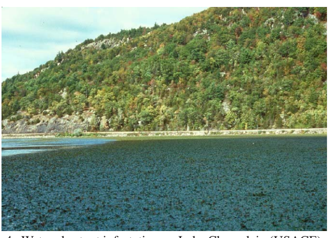
4. Water chestnut infestation on Lake Champlain

Water chestnut has become a significant nuisance throughout much of its range, particularly in the Hudson, Connecticut and Potomac Rivers, and in Lake Champlain. The plant can form nearly impenetrable floating mats of vegetation. These mats create a hazard for boaters and other water recreators. The density of the mats can severely limit light penetration into the water and reduce or eliminate the growth of native aquatic plants beneath the canopy. The reduced plant growth combined with the decomposition of the water chestnut plants which die back each year can result in reduced levels of dissolved oxygen in the water, impact other aquatic organisms, and potentially