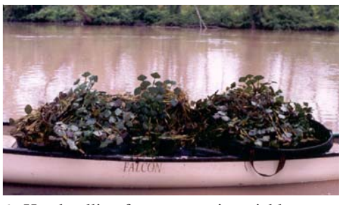
6. Hand pulling from canoes is a viable control of early infestations.

seeds can be part of a long-term control strategy, but due to the long time seeds can remain viable insediments, treatment generally is needed for up to 10 years to ensure complete eradication. The same holds for the use of herbicides. Long-term treatment (mechanical or chemical) can be very expensive. From 1982 through 2001, the states of New York and Vermont