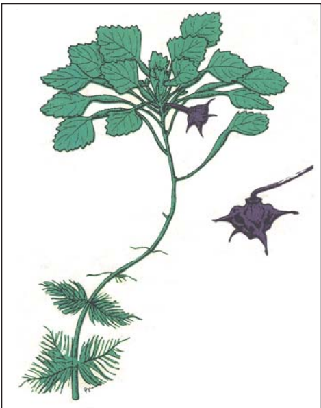
3. Trapa , showing floating leaves (top), submerged leaves (bottom left) and nut (right) (after: CTRIVCOORD)

Water chestnut is an annual that dies back at the end of each growing season. Seeds germinate in the spring with each seed producing 10 to 15 rosettes with each rosette capable of producing up to 20 seeds. The plants starts to produce hard, nut-like seeds in July with the seeds ripening in about a month. The inch to inch and a half wide fruits grow under water and have four very sharp spines, which can lead to