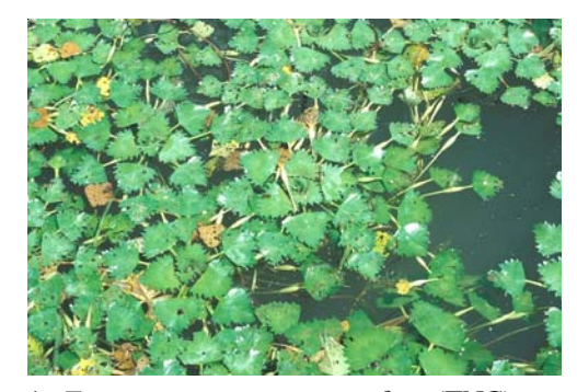
1. Trapa rosettes on water surface (TNC)

The water chestnut is native to Europe, Asia and Africa. In its native habitat, the plant is kept in check by native insect parasites. These insects are not present in North America and the plant, once released into the wild, is free to reproduce rapidly. Trapa colonizes shallow (less than 16 feet deep) areas of freshwater lakes and ponds, and slow-moving streams and rivers, where it forms dense mats of floating vegetation. Water chestnut