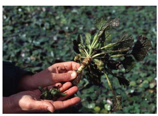
2. Trapa rosette showing nuts and inflated leaf petioles

favors nutrient-rich waters with a pH range of 6.7 to 8.2 and an -alkalinity of 12 to 128 mg/l of calcium carbonate.