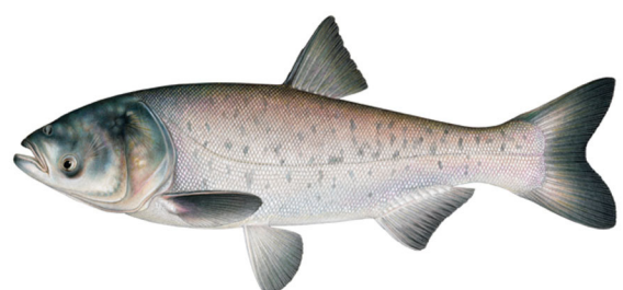
Bighead carp has been identified as one of four species of Asian carp as a potential invasive threat to the Great Lakes, art: Joseph Tomelleri Cimarron Trading Co.

To limit and, in some cases, prevent the spread of AIS and protect the health of popular fishing spots and recreational waterways, it is important for the public to be able to accurately identify and report AIS. Once AIS become established in areas,