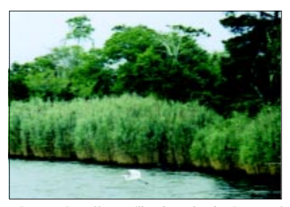
Restoration efforts will reduce the dominance of the common reed ( Phragmites australis ), found growing along the banks of Beaver Dam Creek.

The emphasis of the actual restoration is removing the dredged spoils on the historical wetland areas, opening some of the dikes to allow regular tidal flow, and controlling invasive plant species, particularly common reed (Phragmites australis). These activities will allow for natural marsh functions to return, as well as the plants and animals dependent on wetlands. The work will be done on land owned by the Post-Morrow Foundation and the Suffolk County Parks, Recreation and Conservation Department. A small-scale project on a three-acre piece of Post-Morrow Foundation land has already been successfully restored. The goal is to restore more acres in the future.