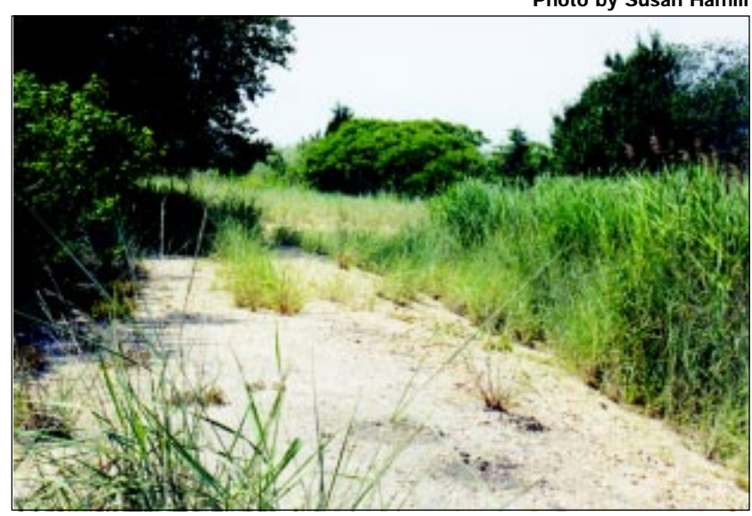
As the channel was straightened, dredged spoils were dumped into the wetlands, covering native vegetation and destroying fish and wildlife habitat. Captions by Barbara Branca

Robert Kent worked with Oregon and Louisiana Sea Grant on the National Ecosystem Restoration Manual. See page 23 to order.