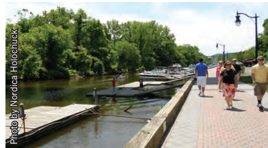
Visitors enjoy the recently expanded walkway along the Rondout Creek in Kingston, NY. Rondout Creek is a tributary to the Hudson located at Kingston, one of the communities that participated in the NYSG study.