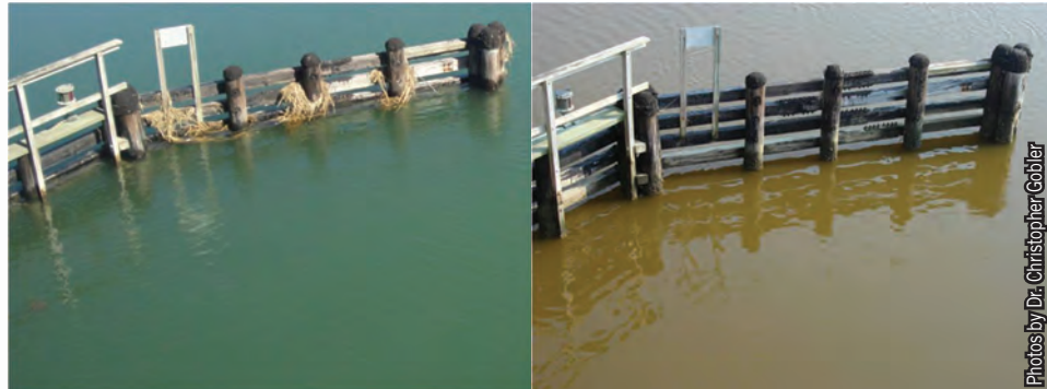
Brown tide lives up to its name. Quantuck Bay on eastern Long Island under normal conditions (left) and under brown tide conditions when the brown tide alga dominates.

The year 2011 has been a banner one for the single-celled alga Aureococcus anophagefferens whose prolific blooms are known as “brown tide.” With concentrations in excess of 2 million cells per milliliter in some Long Island bays, this alga turned the waters brown from western Shinnecock Bay to eastern Moriches Bay, making for intense, though localized, brown tide conditions.