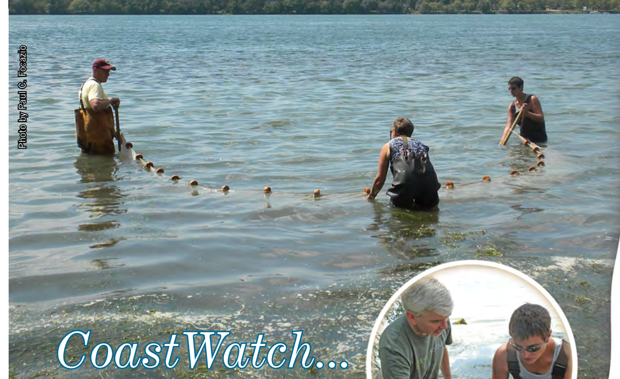
Seining for fish in the Niagara River

NEW YORK COASTLINES 6 FALL 2010