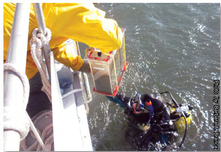
Sea Grant Scholar Stuart Waugh brings up a box corer full of sediment.