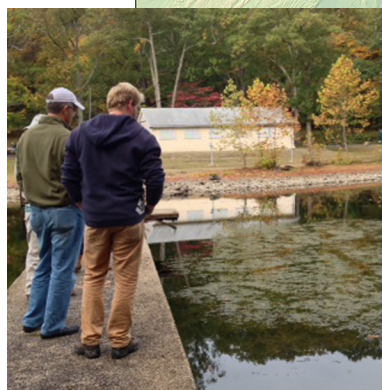
The Lower Hudson PRISM assists stakeholders in five counties; left: volunteers survey Hydrilla in the Croton River.